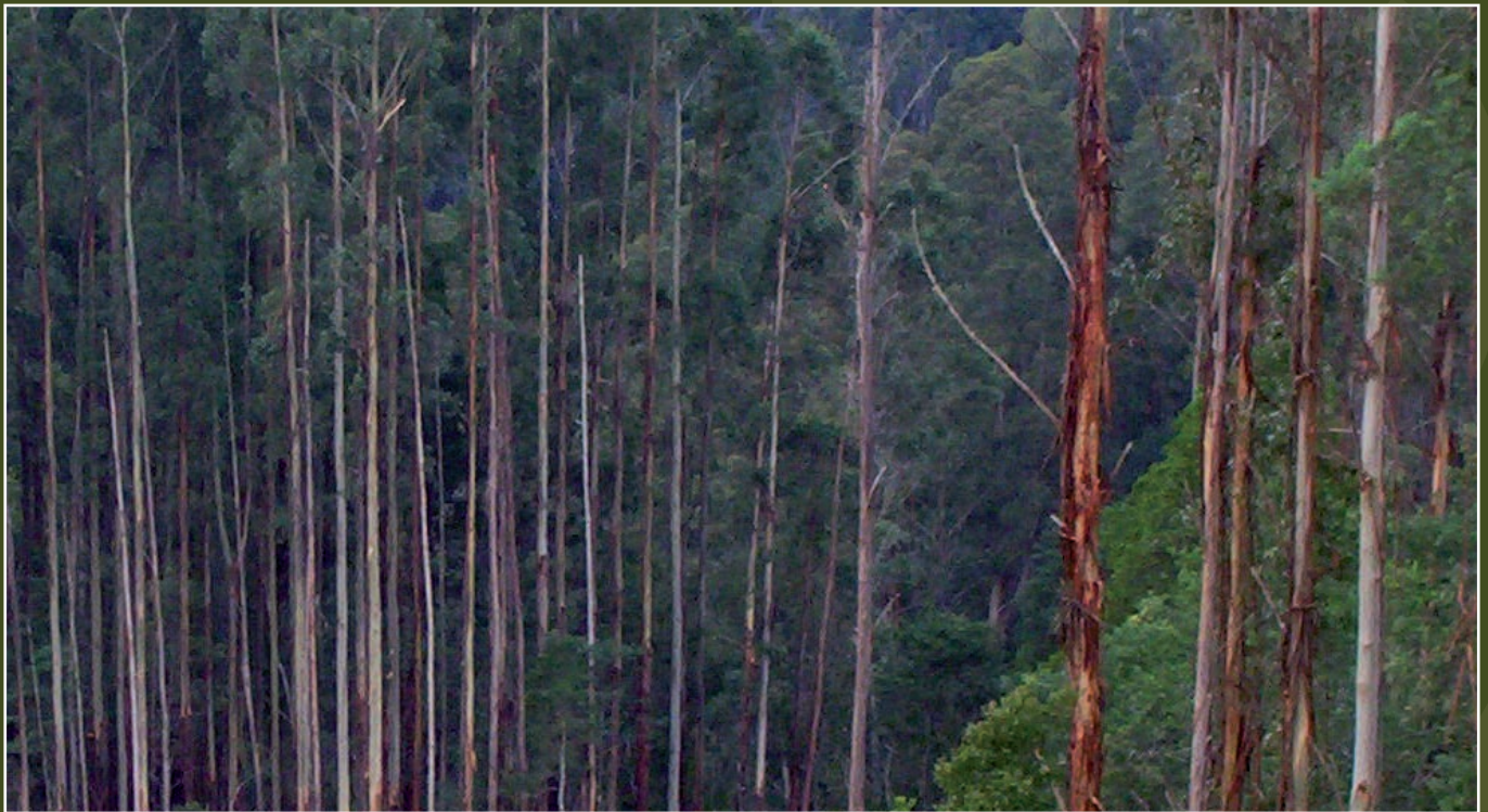
Even-age Mountain Ash plantation.

The Cores and Links comprise approximately 8,000 hectares of both Eucalyptus regnans (Mountain Ash) plantation and native forest in the eastern Strzelecki Ranges located in Gippsland.